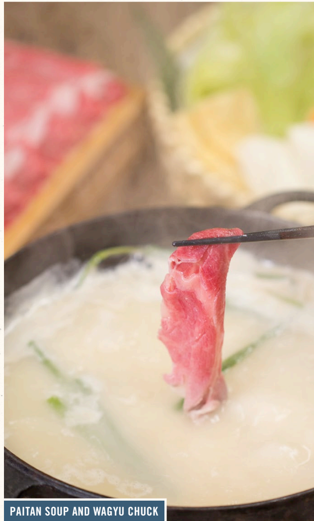
PAITAN SOUP AND WAGYU CHUCK