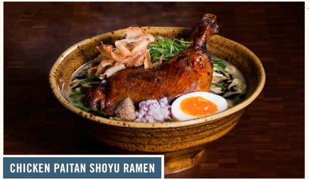
CHICKEN PAITAN SHOYU RAMEN