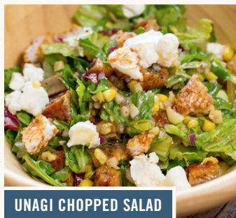
UNAGI CHOPPED SALAD