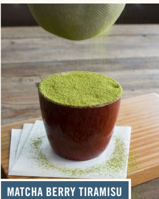
MATCHA BERRY TIRAMISU