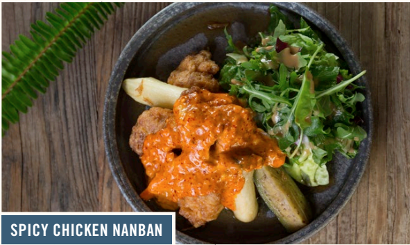
SPICY CHICKEN NANBAN