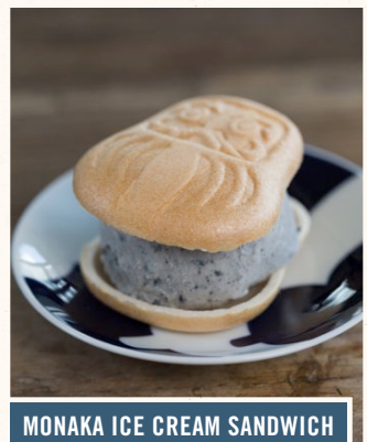
MONAKA ICE CREAM SANDWICH