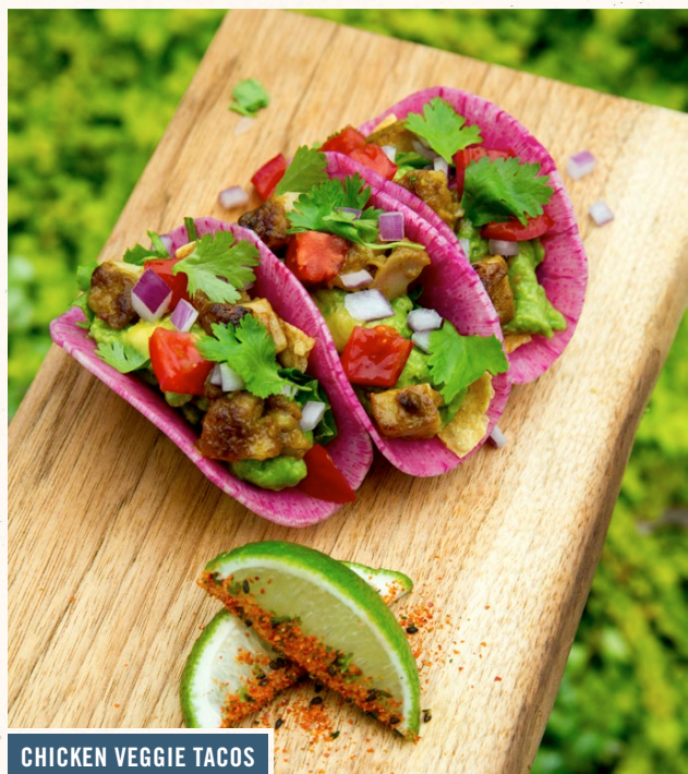
CHICKEN VEGGIE TACOS

SESAME SALMON 8 salmon dressed with sesame soy sauce